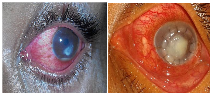
[Table/Fig-1]: Corneal ulcer with hypopyon at presentation. [Table/Fig-2]: Graft re-infection after first TPK.

Paecilomyces is a genus of saprobic fungi. This fungus is effective in controlling nematode populations by applying it to soil [2]. P. lilacinus is a filamentous fungus found in air and soil. Although P. lilacinus is a common saprobic fungus, P. lilacinus keratitis is a very rare, but serious disease entity. The microscopic picture of